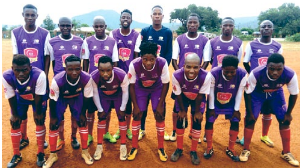
Football teams participating in the SAB SAFA Sekhukhune Regional League will wait for the president's directive on COVID-19 issues before they can continue with the league.