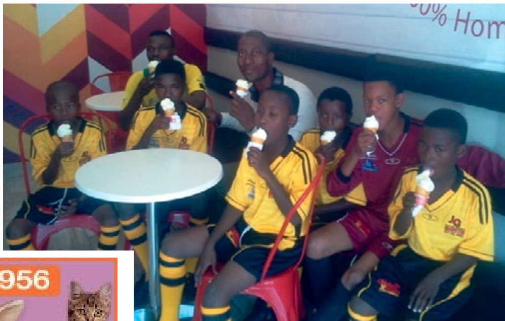
The Herbzer Sports Development and Skills Academy team will continue with their normal activities after the corona virus nationwide lockdown break.