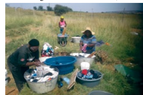
Residents of the draught stricken OK Matsepe Section in Tafelkop Village fetch water from the nearby rivers and wells. Residents fears to contract corona as they will not be able to wash their hands frequently.